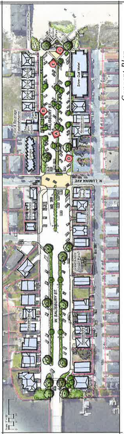
View E - From E. Salisbury Rd median towards Ocean Access Park